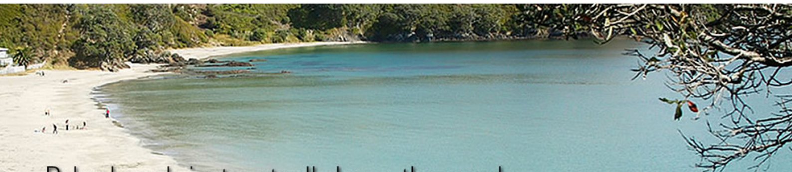
Palm beach just a stroll down the road